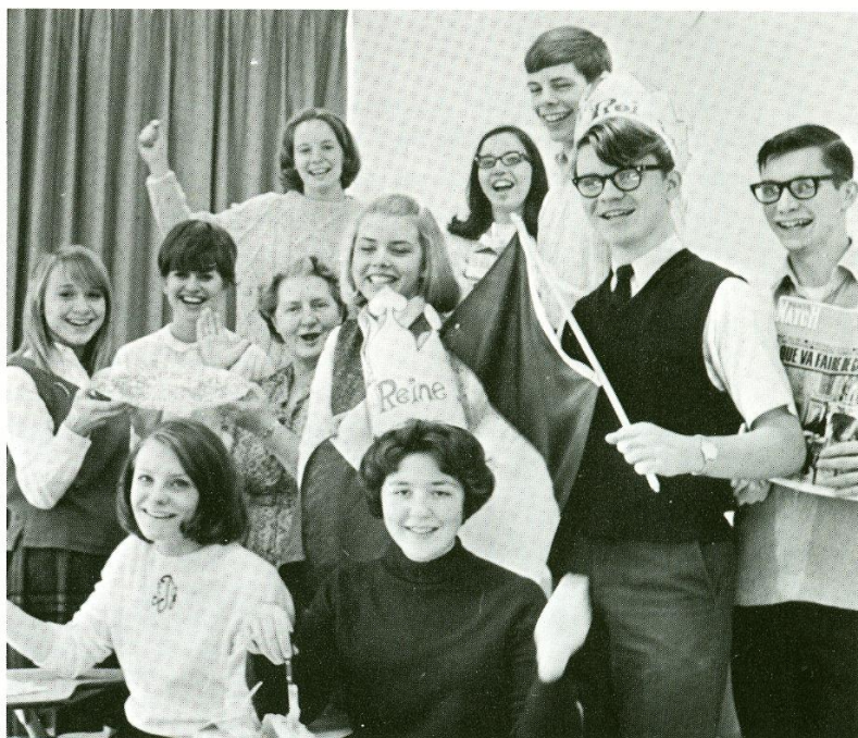
"Vive la classe francais."

They did not overlook the ablative absolute or the genitive singular. Studies concentrated on grammar and reading ability.