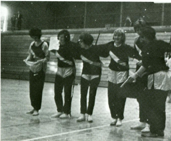
Chic in their daring costumes the cheerleaders prepare for action.