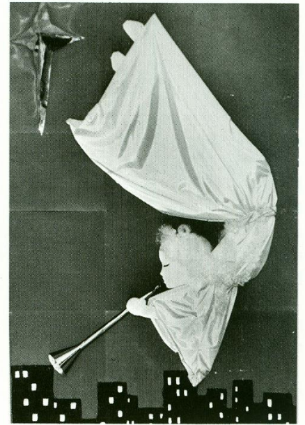
Imagination and skill bring Christmas cheer to the halls of Wayzata High.